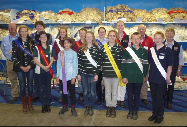
Junior judging at the 2014 Royal Geelong Show.